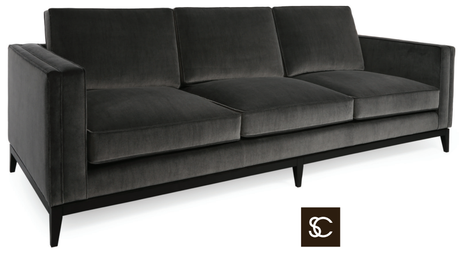
THE SOFA & CHAIR COMPANY

The Hockney Deluxe infuses an additional element of luxury into our iconic Hockney Range. Enhanced with extra detailing such as the recessed wooden plinth and piping along the arms and back; the Deluxe highlights everything that makes this exquisite sofa range both timeless and unique.